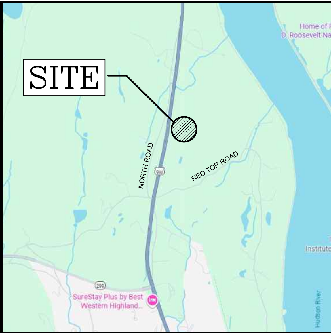
SITE LOCATION MAP SCALE: 1" = 2,000'